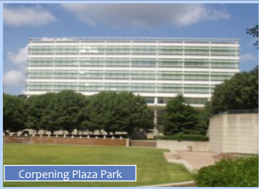
Corpening Plaza Park